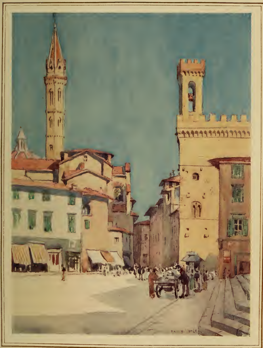
THE BADIA AND THE BARGELLO FROM THE PIAZZA S. FIRENZE